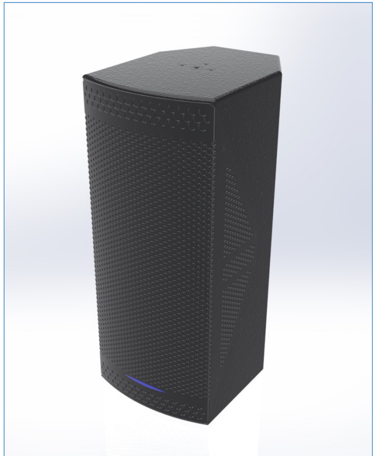
SPOT 2.6-i speaker

SPOT 2.6-i is only available in 16 Ohm. An optional external 200W transformer allows SPOT to be connected to 100V line set up.