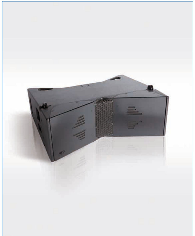
Uniline downfill speaker UL210D

The UL210D speaker has been first developed as a complement to a UL210 based main line array system. The UL210D are designed to be used as a short and medium throw system of its own, or as downfill speakers of a UL210 based system at the bottom of the cluster, or as front fill if put in front for the stage for large stages.