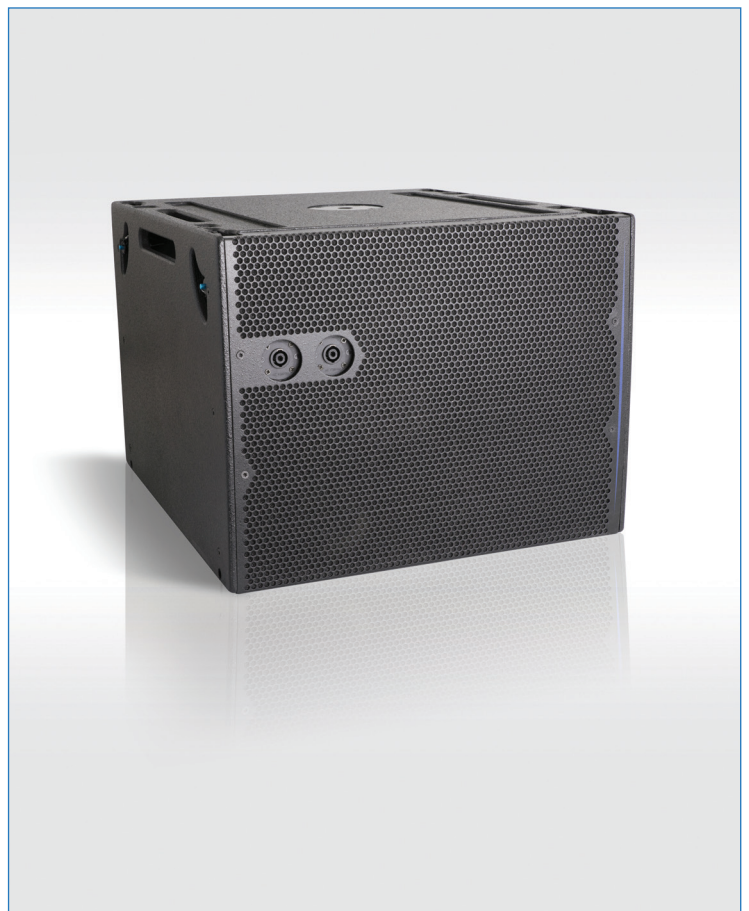
Uniline Compact UC115B - low frequency speaker

The use of APG digital processor is mandatory.