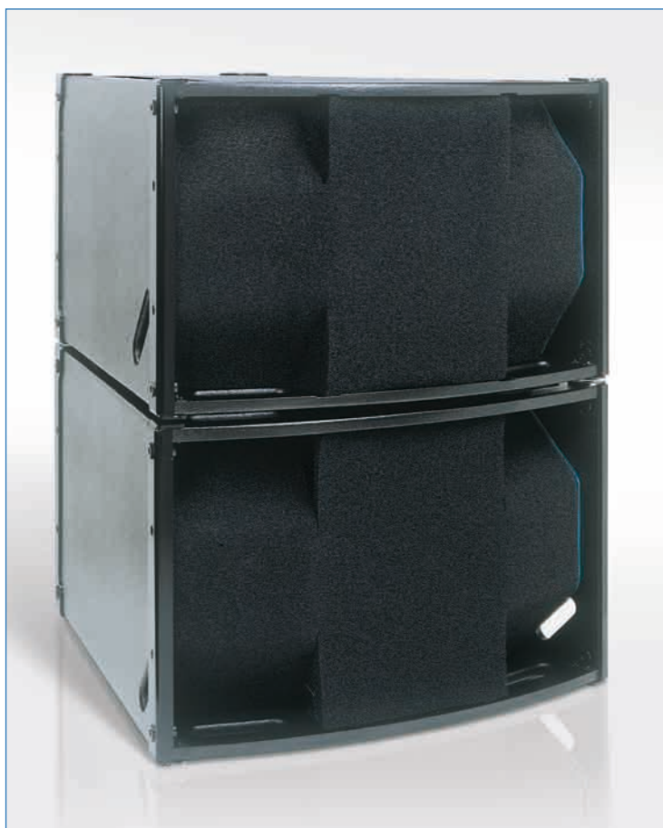
One APG 4000 system = 1 x 4000HI + 1 x 4000LO

For extension in low frequency, APG recommends the following subwoofers : SUB238S, TB115S, TB118S, TB215S or TB218S.