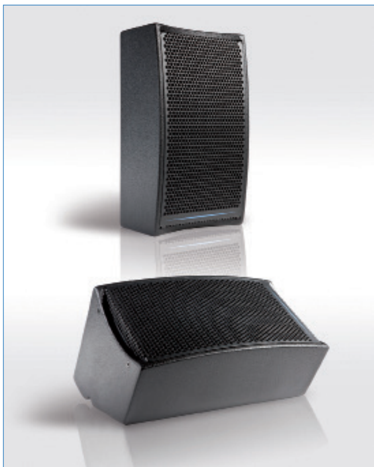
Multi purpose DX8 speaker in FOH and floor monitor

Like the other APG Dispersion series, the DX8 uses a coaxial loudspeaker set that provides a very coherent acoustic field with 105° conical coverage. The DX8 is characterized by an exceptional power/size ratio, great clarity in sound reproduction and a very sophisticated ergonomics: due to its cabinet geometry, with its 30° slanted panel, the DX8 is at home either on the stage as a monitor, or as a main front of house speaker. The wooden enclosure features a 36 mm pole mount socket, two cut-out handles and a recessed space for the "touring" quick removable fixing system QRFS30. Threaded inserts are also standard equipment, allowing the use of a 4 mm steel bracket for fixed installation (option ETDX8).